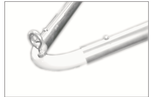
Figure 6: Installed corner piece.