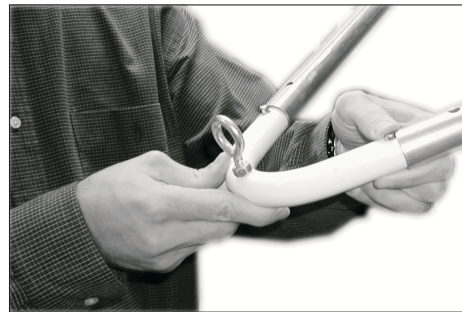
Figure 5: Press buttons down on corner piece, and side into bars until the button pops thru the hole in bars.