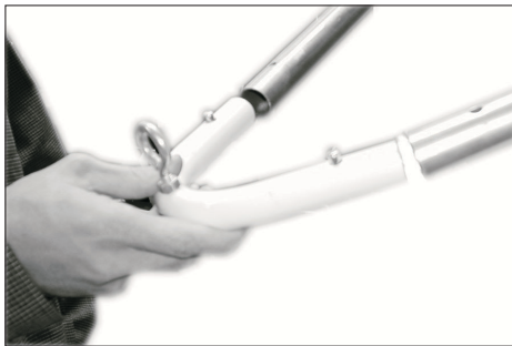
Figure 4: Line up corner piece, buttons up, with steel bars.