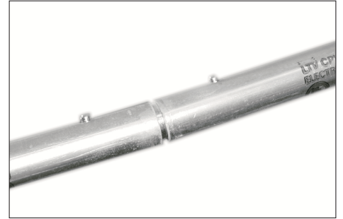
Figure 3: Press buttons down and slide connector into bars until the button pops thru the hole in the bar.